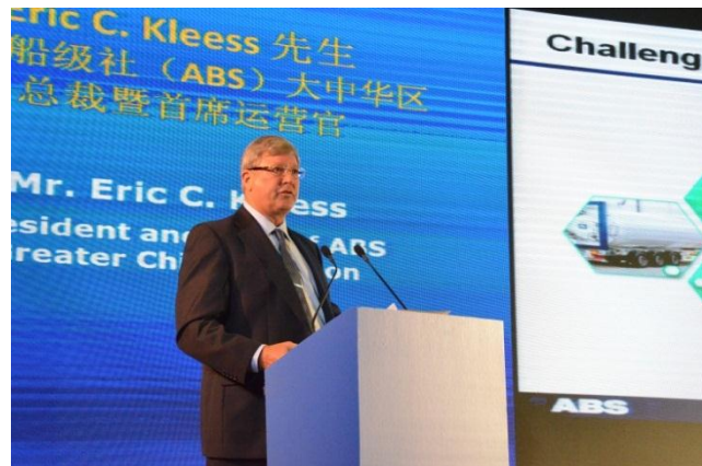
Kleess presents the topic of using LNG as fuel at the World Shipping (China) Summit 2014

The summit, with the theme of “Adapting to New Norms,” was held 5-7 November. More than 700 delegates from international organizations, shipping, shipbuilding and ports attended.